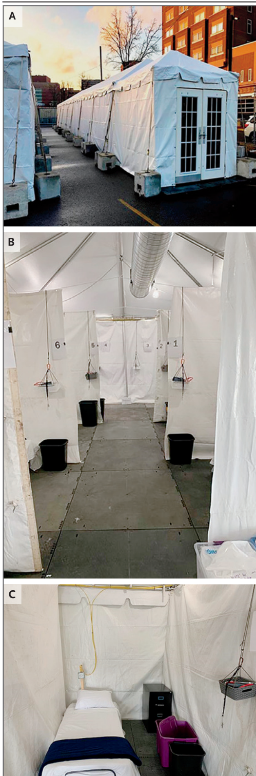
Figure 2. Alternative Care Sites.

During the Covid-19 pandemic, the Boston Health Care for the Homeless Program worked with local design and construction companies and government to create temporary structures that would serve as alternative care sites for the quarantine and isolation of homeless patients (Panel A). The tents have a separate entrance for patients, as well as designated space for the staff to put on and take off personal protective equipment. Patients are separated into “pods,” which are rooms that allow patients to stay 6 ft apart and are built with floor-to-ceiling dividers made of heavy plastic, a material that can be easily cleaned between patient stays (Panel B). Each pod has a bed, storage space, an electrical outlet, a garbage pail, and a vital-sign monitoring station, which can be seen hanging in a basket (Panel C).